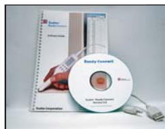
Computer Interface Kit - connects to any Windows™ application