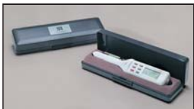
Hard Plastic Protective Case - protect your investment